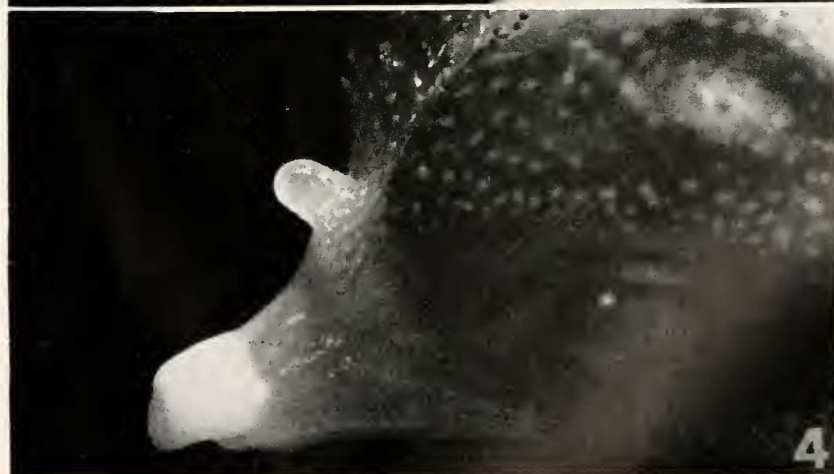
FIGURE 2. Snood at 13th day of incubation. FIGURE 3. Snood at 14th day of incubation. FIGURE 4. Snood at 15th day of incubation.